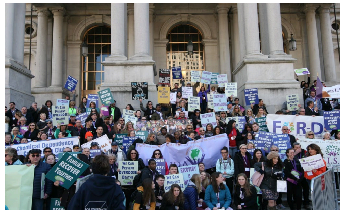
A reminder of how we used to do it in Albany! As always LIRA is right in the middle of things during this gathering of advocates on the Capitol steps (Advocacy Day February 2019).